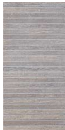
LAM15335 Multilama 30x15 cm. 12"x6" NEW Rovere Grigio