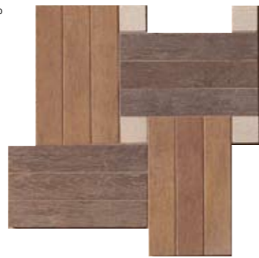
INTRE01 Intreccio 32x32 cm. 12 3/4 "x12 3/4 " Rovere Biondo e Rovere Moka