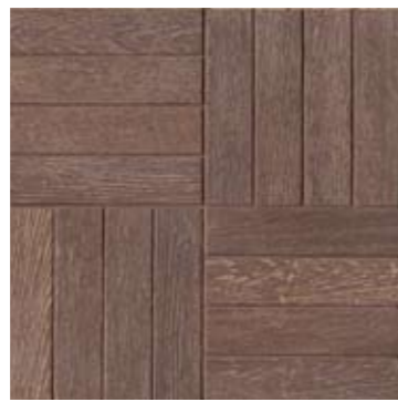
DOM323 Decoro Domino 30x30 cm. 12"x12" Rovere Moka