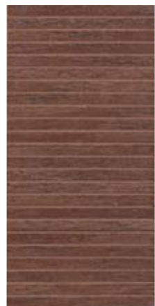
LAM15336 Multilama 30x15 cm. 12"x6" NEW Rovere Ciliegio