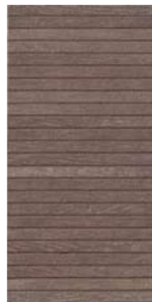
LAM15323 Multilama 30x15 cm. 12"x6" NEW Rovere Moka