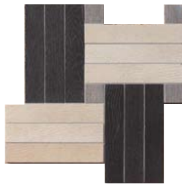
INTRE02 Intreccio 32x32 cm. 12 3/4 "x12 3/4 " Rovere Nero e Rovere Chiaro