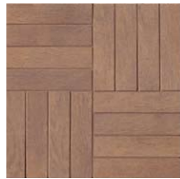
DOM322 Domino 30x30 cm. 12"x12" Rovere Biondo

Decorative pieces . Dekore . Décors . Decorados . Декоры