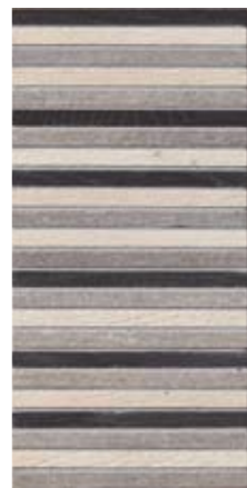
LAM15MIX2 Multilama Mix 2 30x15 cm. 12"x6" NEW Rovere Chiaro, Rovere Nero, Rovere Grigio