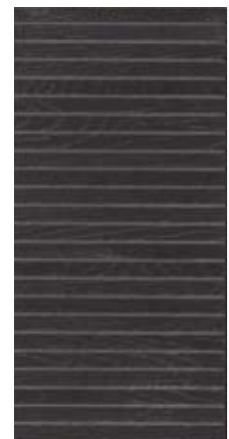
LAM15320 Multilama 30x15 cm. 12"x6" NEW Rovere Nero