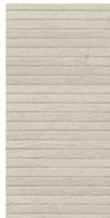
LAM15342 Multilama 30x15 cm. 12"x6" NEW Rovere Bianco