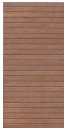
LAM15322 Multilama 30x15 cm. 12"x6" NEW Rovere Biondo