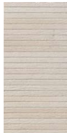
LAM15321 Multilama 30x15 cm. 12"x6" NEW Rovere Chiaro