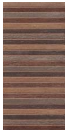
LAM15MIX1 Multilama Mix 1 30x15 cm. 12"x6" NEW Rovere Biondo, Rovere Moka, Rovere Antico, Rovere Ciliegio